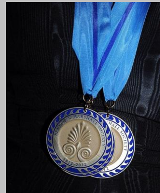
Limited Edition Centennial Celebration Medallion