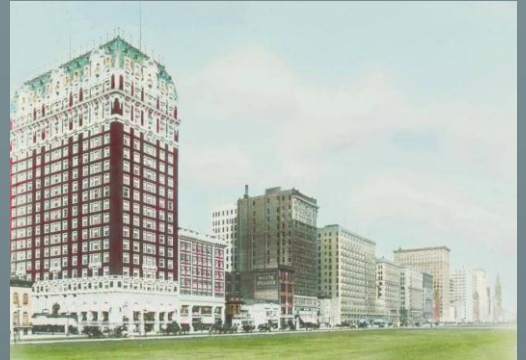
A lovely view of the Blackstone Hotel, c. 1910 - and the perspective north on Michigan Ave.